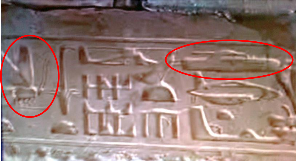
Door Lintel Seti 1

Musca the Fly from where comes the J-Rod "Grey"