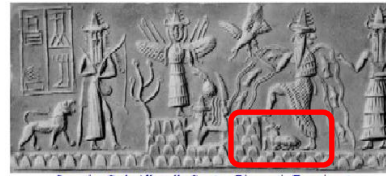
Sumerian Gods Allowedly Create a Bioknastic Experiment

Ambassadors of the Tuscan language April and May and the sea will cross the Alps The man of the calf will deliver an oration not coming to wipe out the French way of life.