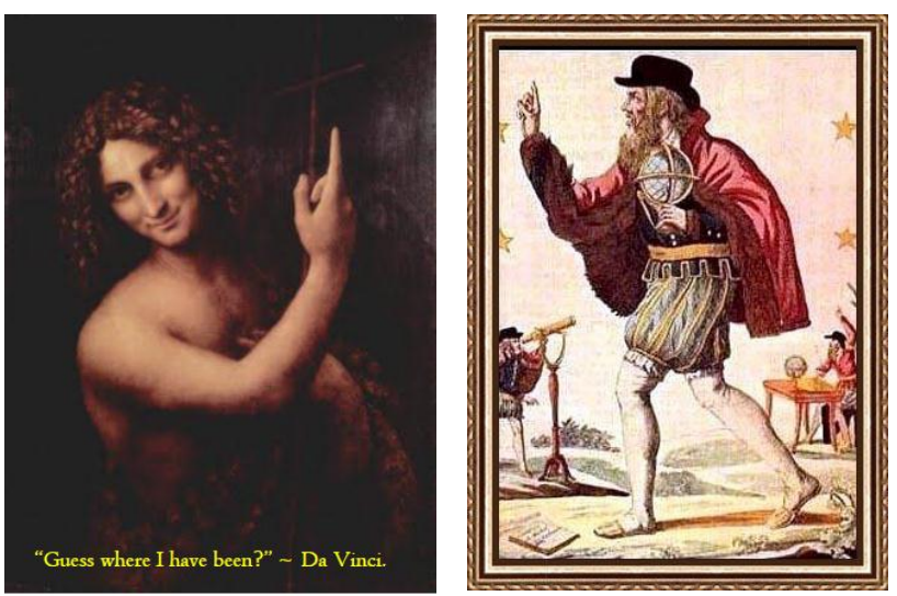
4 50 1 SEER RELIES SPHERE'S HELP RARER LIBRARIES

HERA is the name of an asteroid, but it always means ANY asteroid in the texts