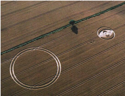
Nick Nicholson July 2008

The moon orbiting Earth: with a planetoid (the Lunar Nursery) in its elliptical orbit around the moon