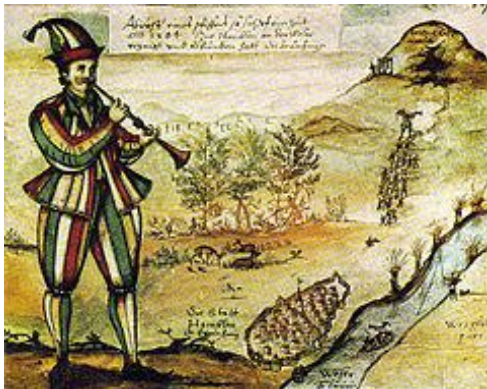
The oldest [citation] picture of Pied Piper copied from the glass window of Marktkirche in Goslar Lower Saxony, Germany, Wiki

7 38 4 Traineé, tiré, horriblement mourir ENTRAINED. DRAGGED, TO DIE HORRIBLY the text hidden: THE ERROR: BURLIER TERMINATION – O (orbit) MIR (space station) NUTRITIONAL MEAL THEREIN: IT MIRROR RETRIBUTION... [YOU] REMEMBER HIRER (the contract between the military complex and the Other worlders for "trade in men") see 1 27 3 and 10 62 above on page 17