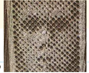
Face in Lace crop circle 2001 Alexander

CELA: ALEC [Cygnus star] LACE [face in lace] C [Ophiuchus] ALE – May 13 – June 9