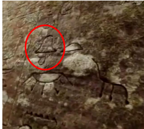
THESE ARE HIEROGLYPHS AT KARIONG IN N.S.W. AUSTRALIA

THE FLEUR DE LIS IS ALSO SEEN EVERYWHERE – "FLOWER OF FIRE" IS ALSO AN ALCHEMY KEY