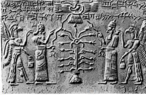
"Tree of life" is a machine 2 70 3 "The tree in stone" devilish species restored