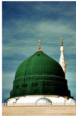
MADINAH SAUDI ARABIA