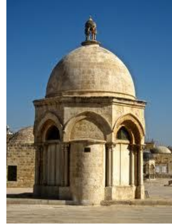
CUPOLA MIDDLE EAST