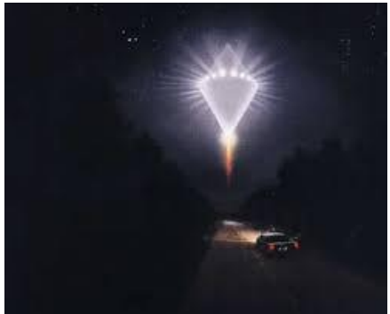
ONE OF CASSIOPEIAN CRAFT