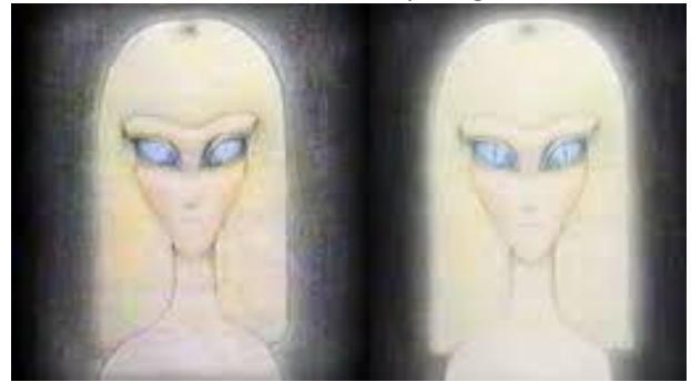
Synthetic females, the same whose DNA was extracted from pubic hairs

"I started to search in internet about CE III cases and drawings based on witnesses descriptions.