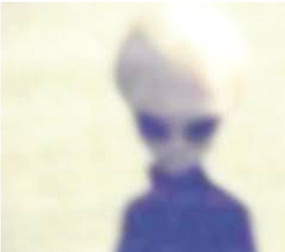
ONE OF THE "ELDERS"