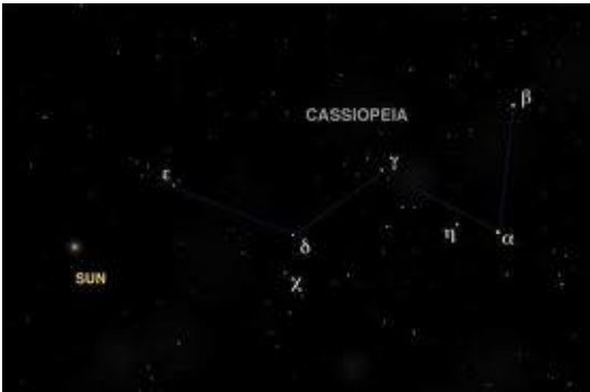
OUR SUN, ALPHA CENTAURI AND CASSIOPEIA