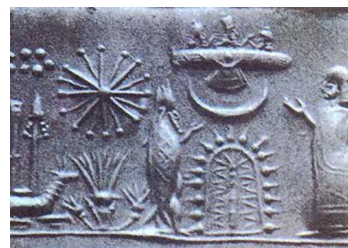
Note: the people in the flying craft, the "fish-man", the Giant

O = Andromeda note: 'we' plural. X = joint SILURID – a fish found in Asia Minor. Or the Oannes 10 Chemtrails