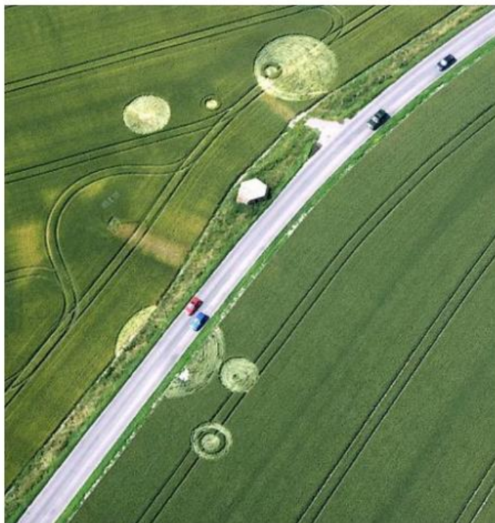
Expanded illustration follows

July, 2005, certainly was one of the most humorous formations I have seen. As one can see the formation is on both sides of the road with one circle straddling the road itself. If viewing this on the main Timeline you will probably have to click on the photo to see the full image.