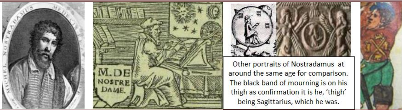
Other portraits of Nostradamus at around the same age for comparison. The black band of mourning is on his thigh as confirmation it is he, 'thigh' being Sagittarius, which he was.

2 67 1 Le blonde au nez forche viendra commette and the quatrain line hidden texts in its full context