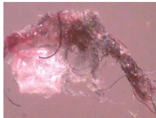
Mysterious and still-unidentified fibrils embedded in skin removed from facial lesion of three year old boy. Photomicrograph 60x.

HOW ARE CHEMTRAILS AFFECTING THE BEES? NO MORE BEES, NO MORE POLLINATION, NO MORE PLANTS, NO MORE ANIMALS, NO MORE MAN."