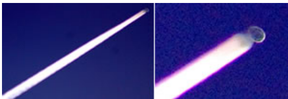
July 15 2009