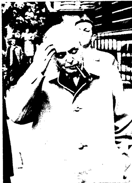
"WILSON" nee hundha Mach deparic